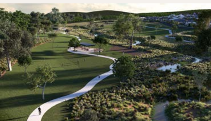
All images are Artistic Impressions