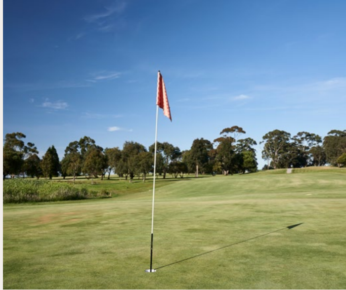
50. Colac Golf Club & Racecourse