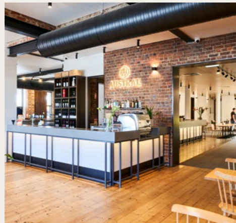
17. Austral Hotel