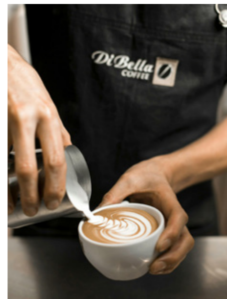
CASUAL COFFEE CATCH UPS.