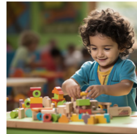
PLAY AND LEARN.