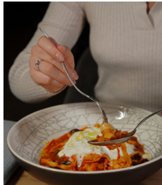
LUNCH WITH FRIENDS.

Enjoy a vibrant lifestyle of convenience at Parkside Collective Deanside. The future Deanside Central Shopping Centre will be right on your doorstep for all of your essentials, while more major retailers, speciality stores, cafes and restaurants can be found at the nearby CS Square and Central Shopping Centre just 10 minutes away in Caroline Springs.