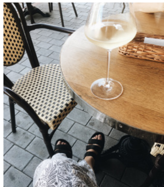
DINE OUT ON CHOICE.