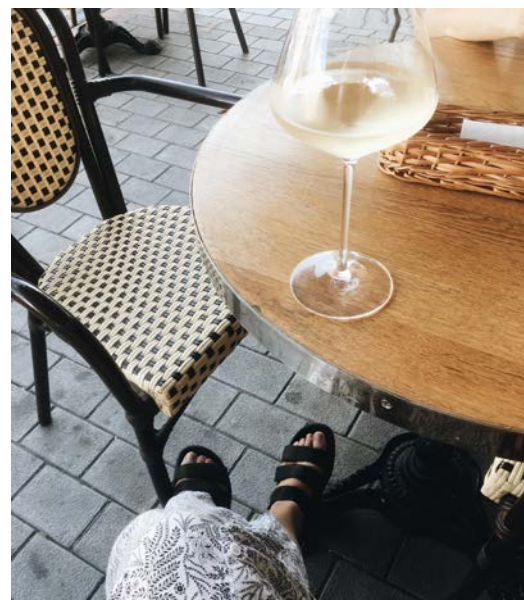
DINE OUT ON CHOICE.