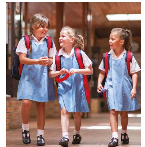
WALKING DISTANCE TO SCHOOLS.

Greenvale is abundant in beautiful green spaces such as the nearby picturesque Greenvale Reservoir Park and Woodlands Historic Park, along with numerous neighbourhood playgrounds and sporting clubs. You'll be surrounded by a range of quality childcare and schools, including Montessori Beginnings, Bradford Avenue Preschool, Greenvale Primary School and Aitken College, all within a 5-minute drive.