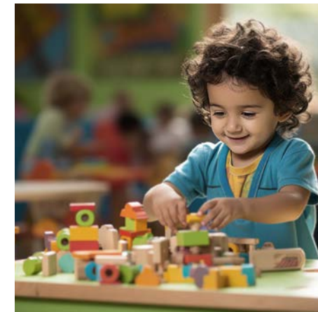
PLAY AND LEARN.