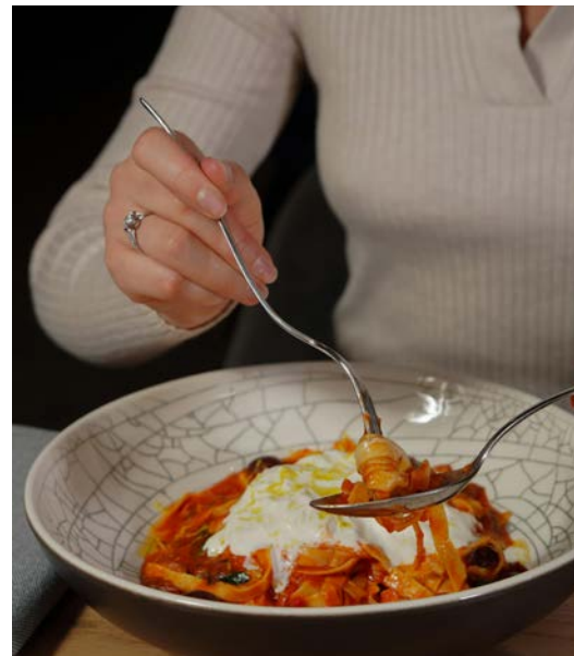
LUNCH WITH FRIENDS.

Enjoy a vibrant lifestyle of convenience at Parkside Collective Greenvale. Greenvale Shopping Centre is on your doorstep for all of your essentials, while Roxburgh Park is a short 10 minute trip away, home to a range of shopping and dining options. The proposed Providence Shopping Village will also be close by, featuring speciality food & beverage, entertainment and health tenancies.