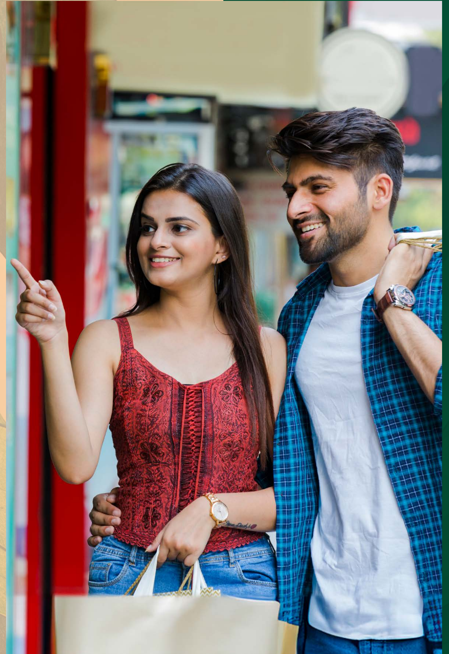
LOCAL SHOPPING DISTRICT.