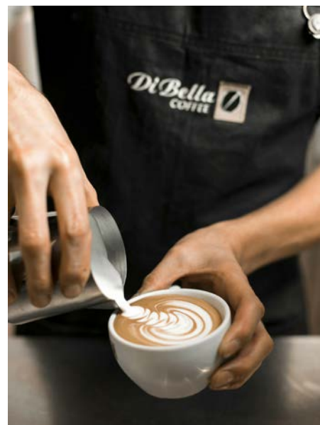
CASUAL COFFEE CATCH UPS.