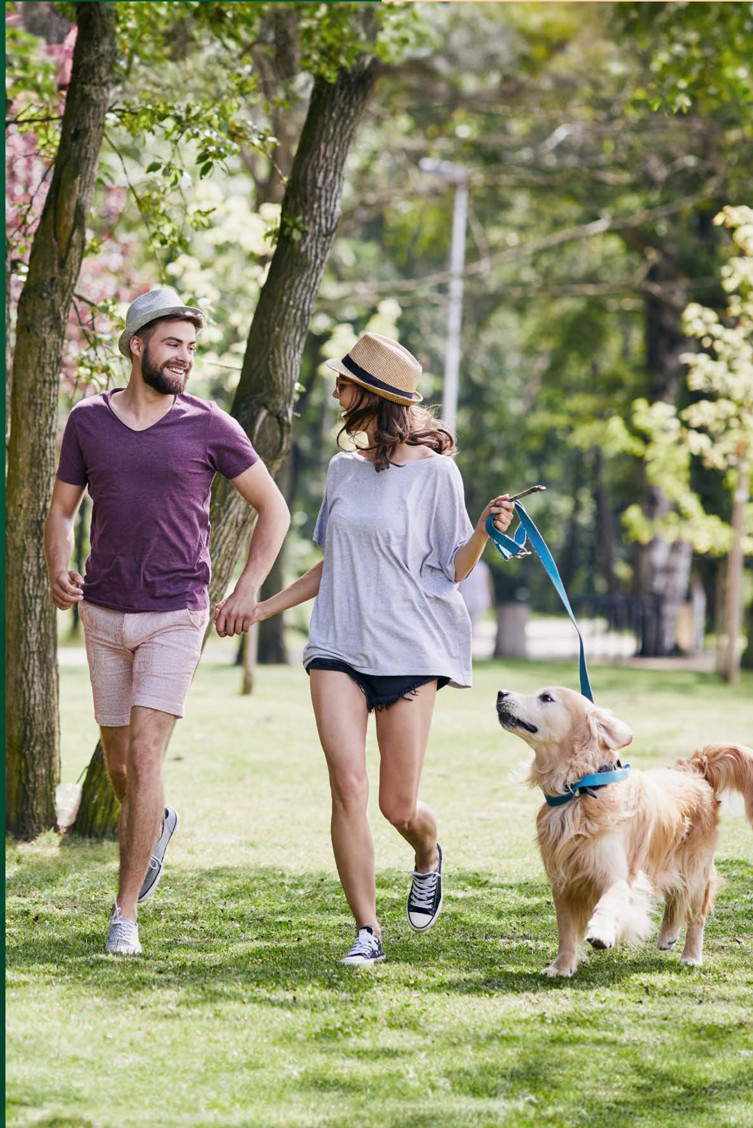
WALKS IN THE LOCAL PARK.